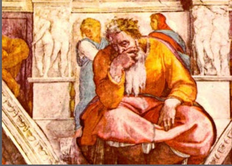
Jeremiah by Michelangelo